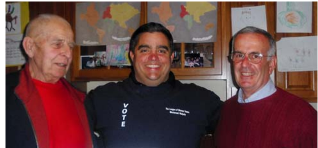
LWV not for women only